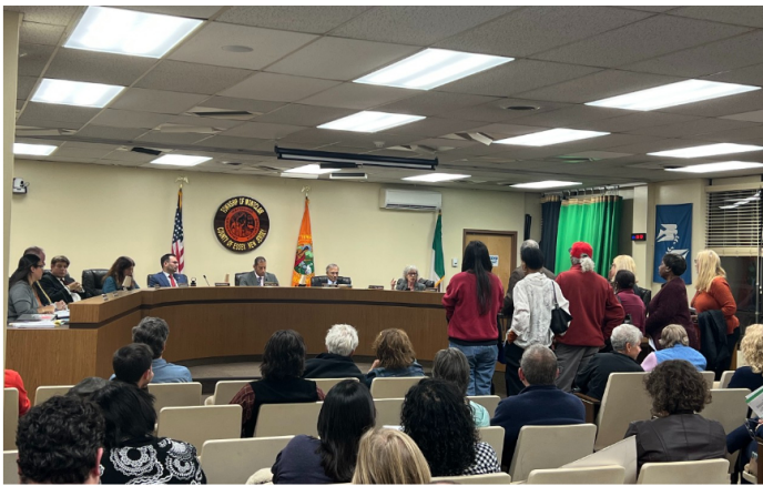
Gray Street residents asks how they are the only street in Montclair to get 25 sidewalk violations.

The red marks from Montclair's code enforcement were made on the street shortly after residents had complained to the Township about a production company operating from a rental property on Gray Street with film crews. Gray Street residents say that soon after the business vacated the residence, a Montclair code enforcement officer came to their street, walking up and down the block, writing up violations.