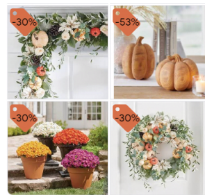
grandinroad Indoor Fall Décor Grandin Road