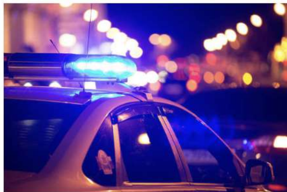
Connecticut Man Suffers Self-Inflicted Gunshot Wound at Woodland Park ...