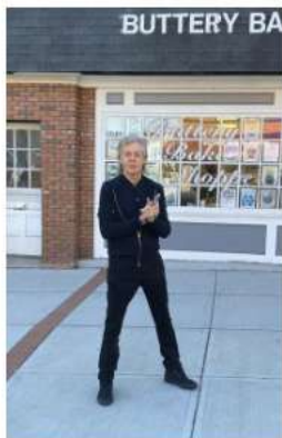
Paul McCartney is Here, There and Everywhere - In New Jersey